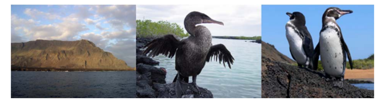
Day 3 - ISABELA Sunday: Urbina Bay/Tagus Cove (Isabela Island) Urbina Bay (Isabela Island)

In the afternoon, we visit the youngest and most pristine island of the archipelago, Fernandina, one of many visitors' all-time favourites. Punta Espinoza has an amazing combination of barrenness and abundant wildlife. Highlights include hawks, penguins, flightless cormorants and astounding views of the surrounding volcanic landscapes.